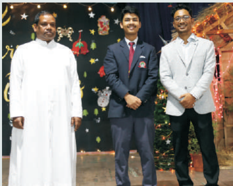
Runner up: Phukan House