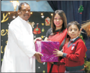
Class- KG B