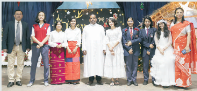
Winner: Lachit house