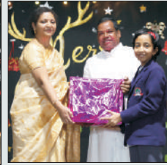
Class- 6 C