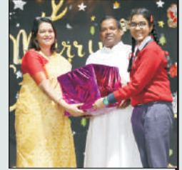
Class- 7 D