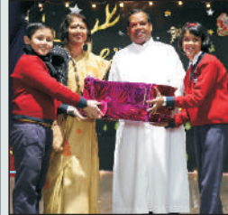
Class- 5 A