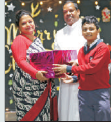
Class- 4 C