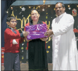
Class- 2 B